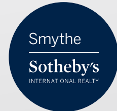
Some platforms may automatically format your social logo into a circle