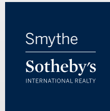
Social Media logo for all platforms